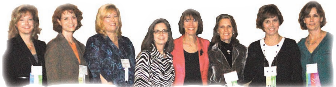
2010 CLD Award Winners and Several CLD Board Members